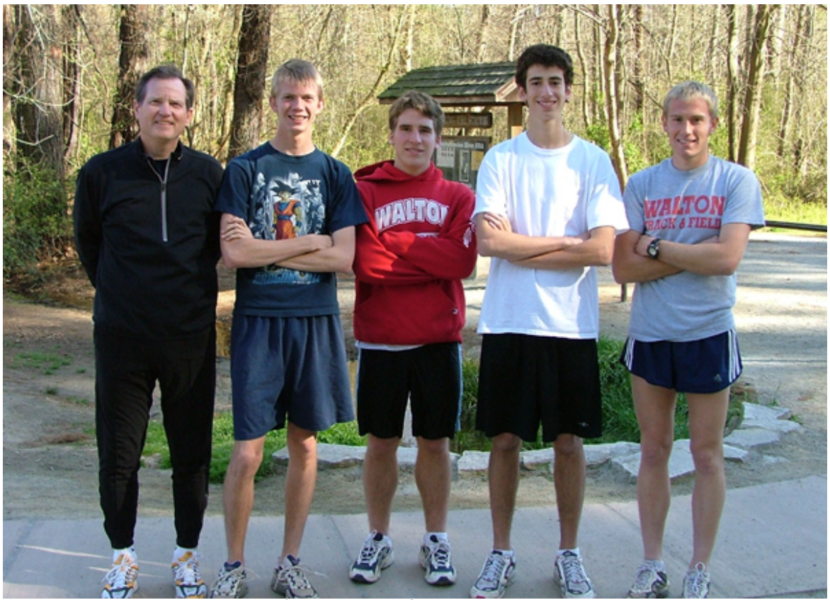
Our New 4 x 1600m School Record Holders

Website design by SportSites Inc. Please visit our webpage for more information.